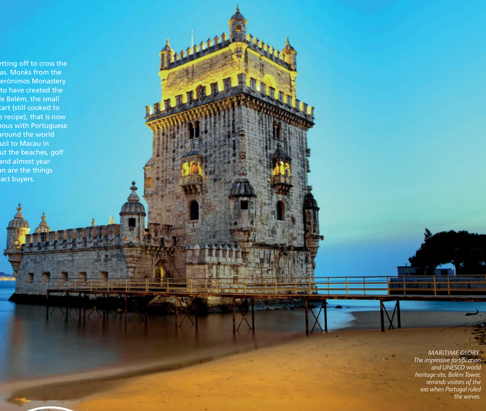
MARITIME GLORY: The impressive fortification and UNESCO world heritage site, Belém Tower, reminds visitors of the era when Portugal ruled the waves.

sailors setting off to cross the seven seas. Monks from the nearby Jerónimos Monastery are said to have created the Pastéis de Belém, the small custard tart (still cooked to the same recipe), that is now synonymous with Portuguese culture around the world from Brazil to Macau in China. But the beaches, golf courses and almost year-round sun are the things that attract buyers.